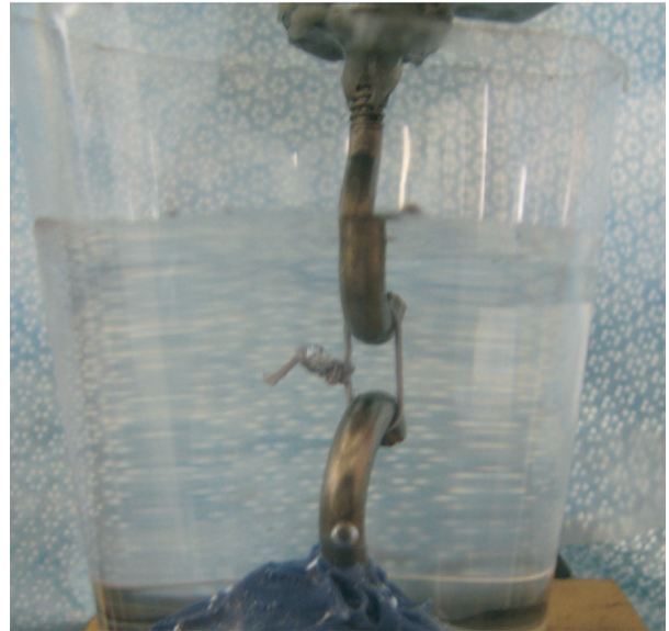
FIGURE 2. Testing of an arthroscopic sliding knot in a water bath containing normal saline at 37°C to simulate an in vivo environment.

Additionally, an arthroscopic non-sliding Surgeon’s knot was tested. This knot consists of 3 half hitches on the same post, followed by 3 reversing half hitches on alternating posts. 5 Each knot was tied with each of the 3 No. 2 polyblended suture types, making 15 different knot-suture combinations. Each configuration was tied 8 times, for a total of 120 samples.